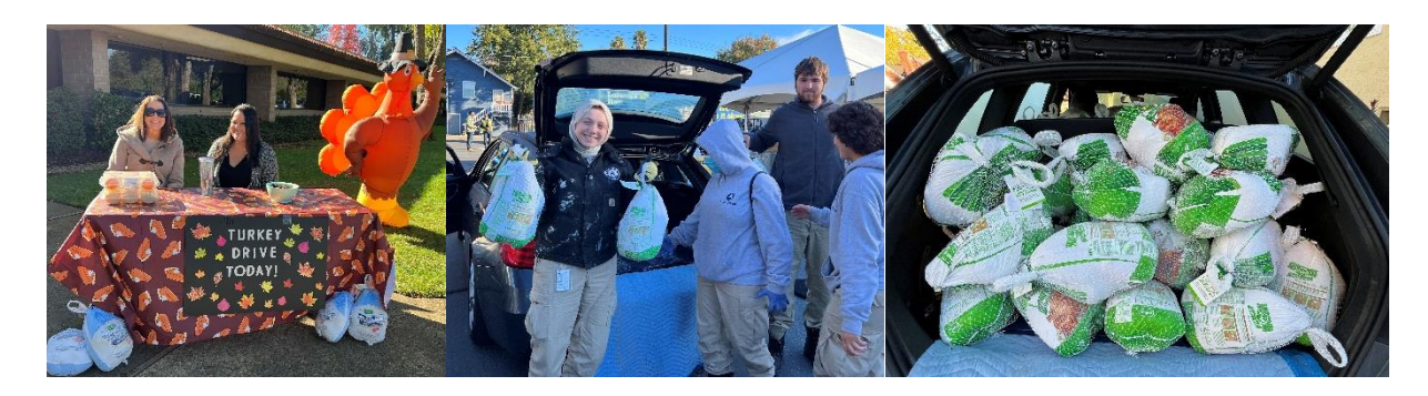
Pictured: The California Department of Corrections and Rehabilitation (CDCR) Office of Research hosted a drive thru event for turkey donations and collected 104 turkeys for the Sacramento Food Bank and Family Services turkey drive in 2022.

Please do not bring cash/check donations on this day. SFBFS provides an opportunity to donate $15 online for a turkey instead.